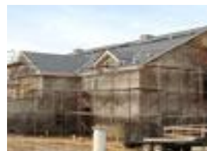
Dairy Barn Renovation

Everyone driving from Route 141 to I-95 sees not only roadwork, bridge construction and work on the new connector, the 141 Spur, but also the progress in rehabilitating the Blue Ball Dairy Barn. The Interstate sign posts are in place and dates for switching traffic back to 202 have been discussed.